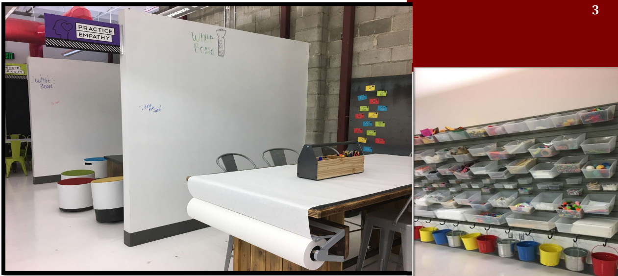
Examples of School Makerspaces. One Stone School, Boise, ID.