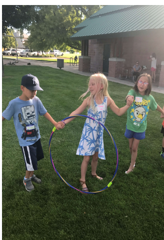
Fun at the summer socials!